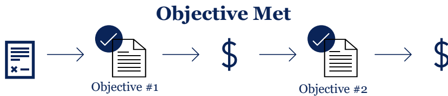
Figure 1: Types of Fixed Amount Subawards

Subgrantee receives several partial payments upon completion of milestones . The milestones and amount of each payment are agreed upon in advance and set forth in the federal award. Objectives can be either tangible or abstract.