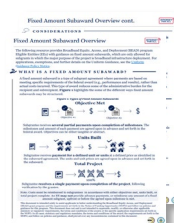
Fixed Amount Subaward Overview