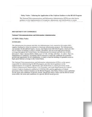
Tailoring the Application of the Uniform Guidance to the BEAD Program