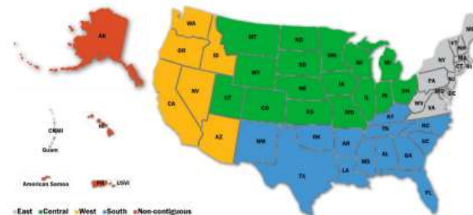
Figure ES4-1: FirstNet PEIS Regions of Analysis