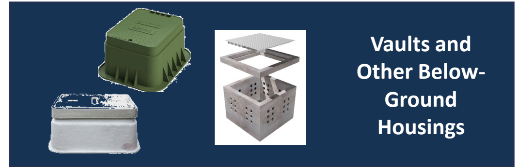
Vaults and Other Below- Ground Housings