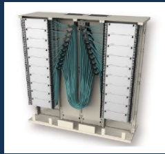
Fiber Distribution Frame@Optical Hub Cabinet

Enclosures are defined as manufactured products used to protect and house a network function.